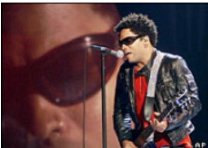
Kravitz has a teenage daughter with former wife Lisa Bonet