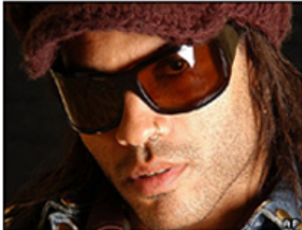
Kravitz is named in a legal case filed in New York

Rocker Lenny Kravitz is being sued over an allegation that one of his toilets overflowed into a neighbour's apartment causing "catastrophic" water damage.